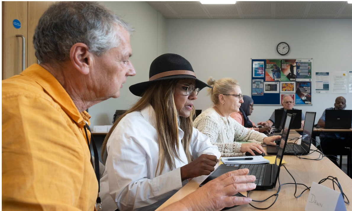
An Adult Learning Excel class at the Gwynneth Morgan Centre in East Hill

Bespoke numeracy programmes have been delivered through Multiply, funded through the UK Shared Prosperity Fund (UKSPF). Additionally, the service is involved in a local authority UKSPF partnership led by the City of London, Jumpstart to Success.