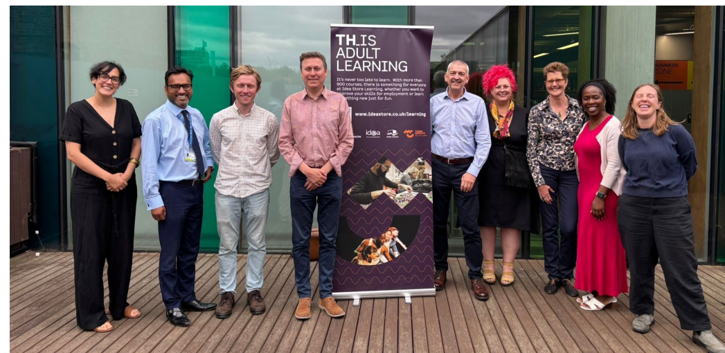
Adult Learning leaders and officers from the GLA collaborate at the Idea Works in Tower Hamlets, contributing to the development of the Inclusive Talent Strategy for London.

“ Adult education services act as community anchors by supporting economic development, fostering personal and professional growth, promoting social cohesion, enhancing health and well-being, and ensuring access and inclusion for all community members. These services create a more educated, skilled, and cohesive community, ultimately leading to a higher quality of life for individuals and the community as a whole. ”