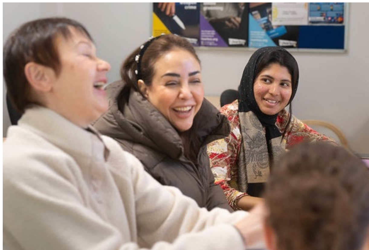
WCLL learners in an ESOL Class.