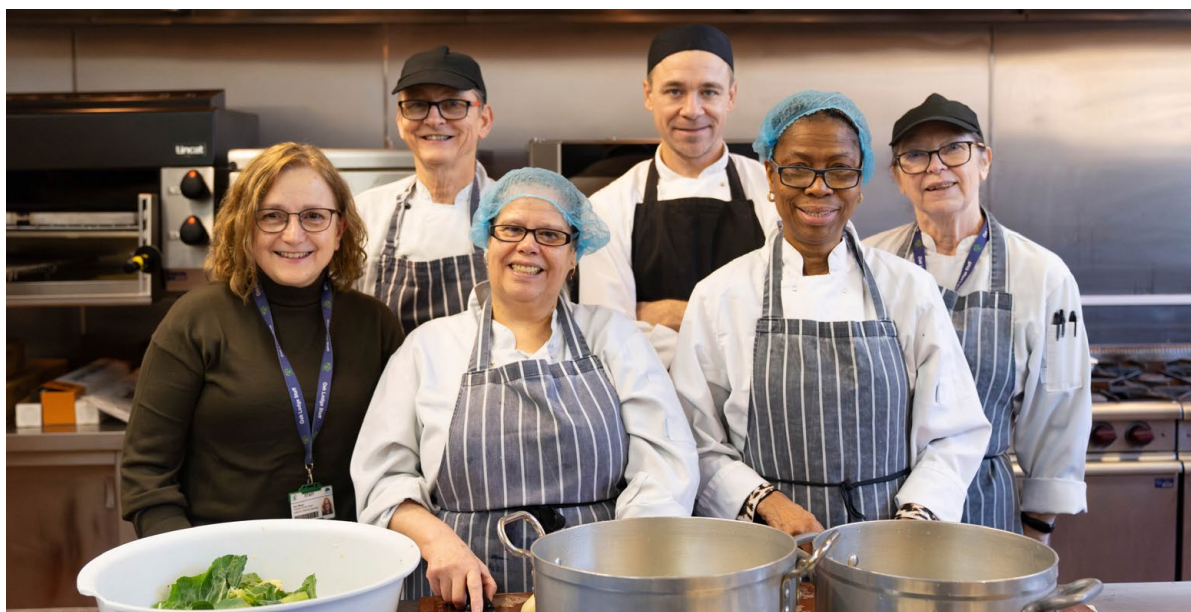
Hospitality provision - Deaf First at Oak Lodge

All current subcontractors can be found here: Community Learning - Wandsworth Lifelong Learning